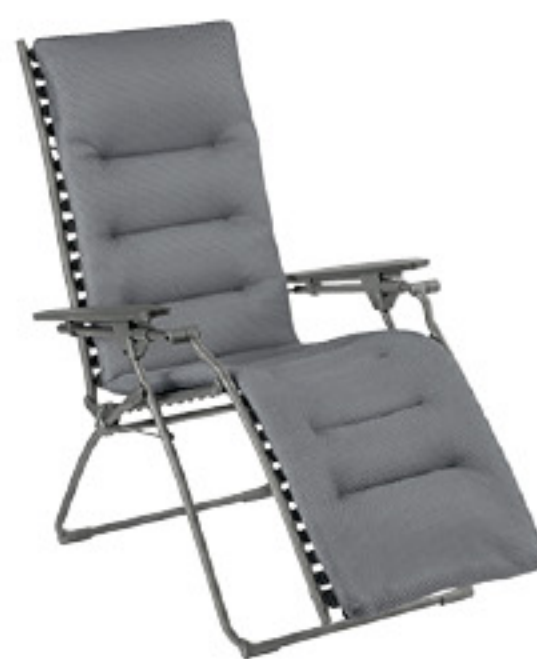
LFM2830 Silver 8901