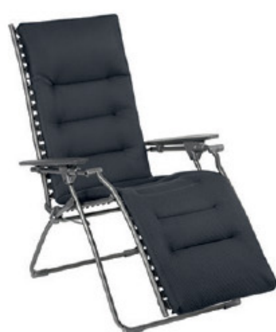
LFM2830 Dark Grey 8902