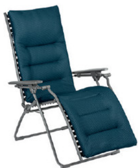
LFM2830 Bleu Encre 8900