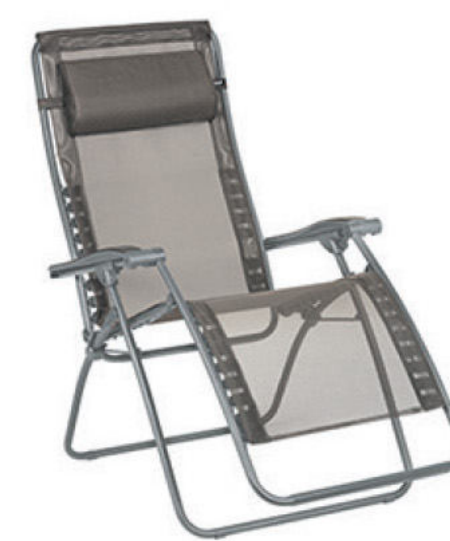
LFM2035 Graphite 8717