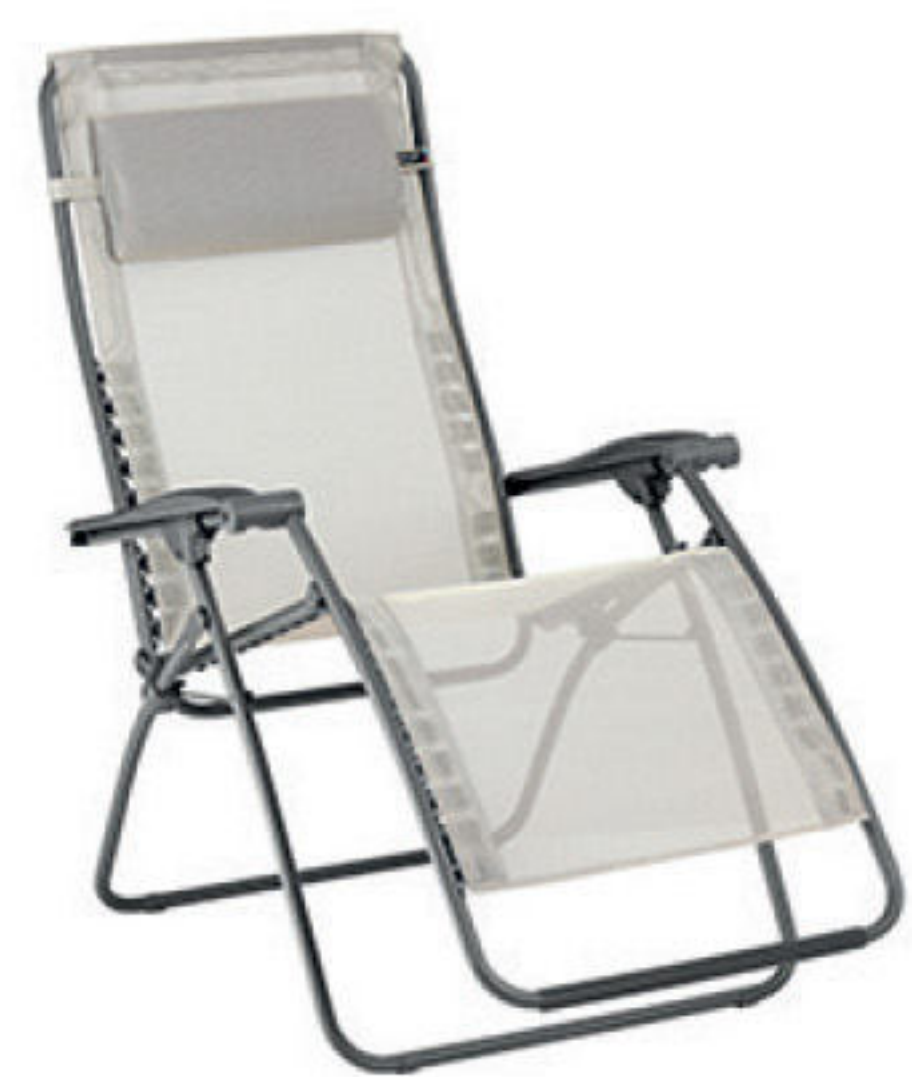
LFM2035 Seigle II 9868