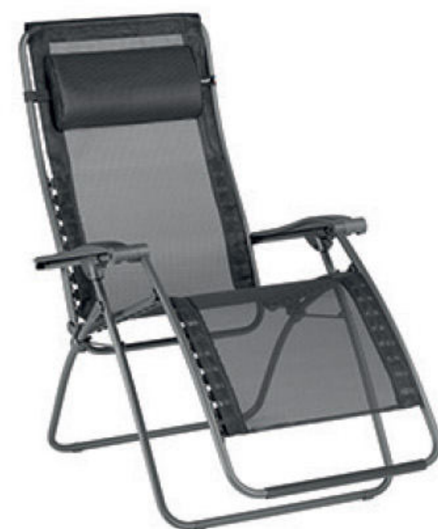
LFM2035 Black 8551