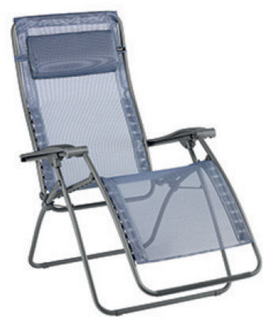
LFM2035 Océan II 9870