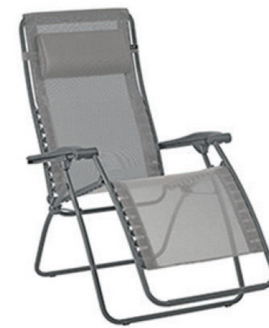
LFM2035 Terre 8556