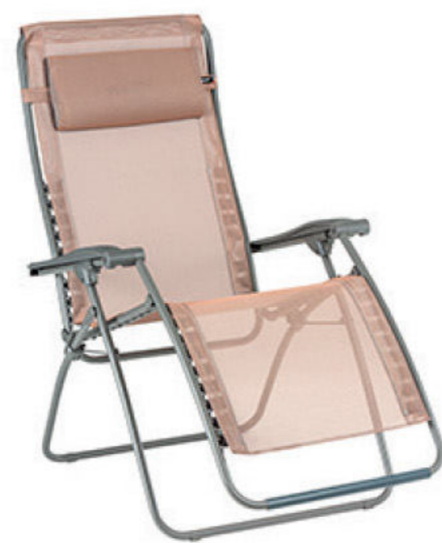
LFM2035 Canyon 9712