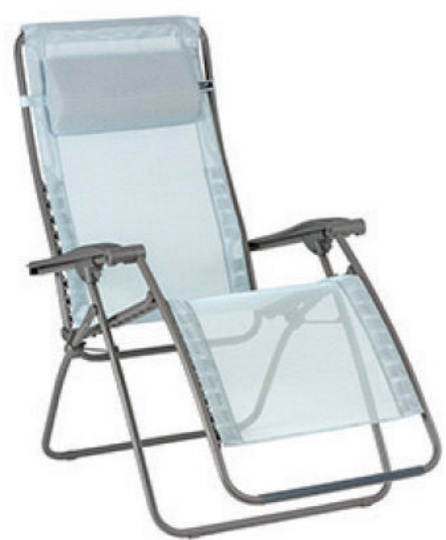
LFM2035 Ciel 9711