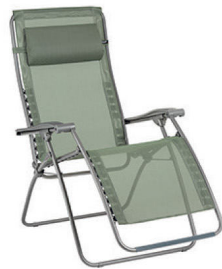
LFM2035 Moss 8557